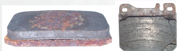
Figure 1. Pictures of detachment of friction material from the backplate and edge crumbling.

Besides pad failure due to thermal damage, brake pads can also be mechanically damaged when they are exposed to a corrosive environment. This can especially be the case in winter time when salt is used to prevent roads from freezing. The salty water in combination with atmospheric moisture forms an aggressive environment. This environment can cause brake pad failure like edge crumbling and detachment of the friction material from the back plate. Both are not acceptable. Even in the absence of salt, hot and humid conditions can cause corrosive damage to a brake system and brake pads specifically.